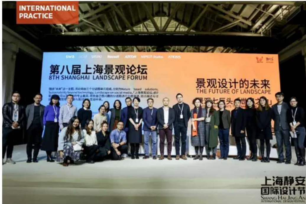
The 8th Shanghai Landscape Forum was successfully held on the afternoon of December 4, 2021 at 800-Show, a Creative Park in Jing'an District, Shanghai. The event was broadcast on four live media platforms, which received the attention of the public and many peers.