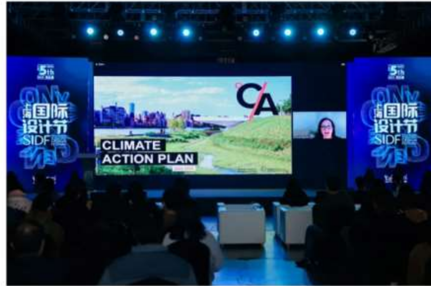
Sarah Fitzgerald, ASLA, introducing the Climate Action Plan