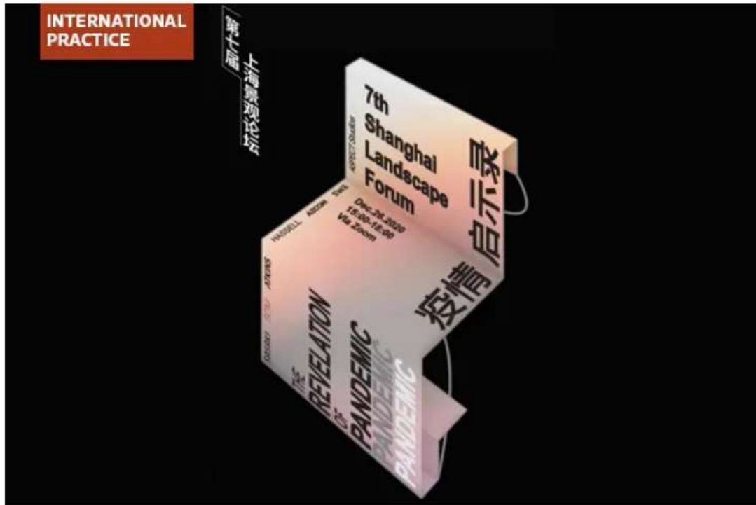
7th Shanghai Landscape Forum – The Revelation of Pandemic (poster)